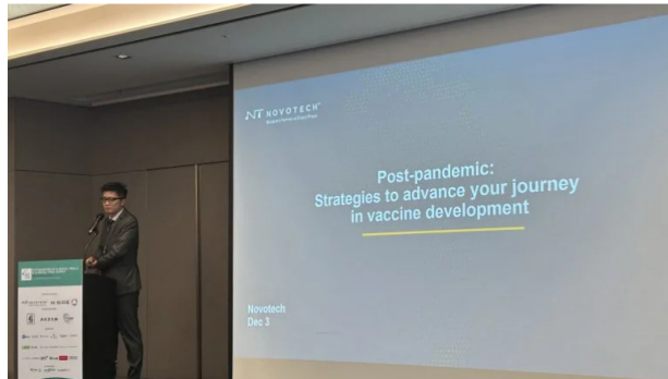
Research by Novotech demonstrates that the Asia-Pacific region dominates in global prophylactic vaccine trial share.